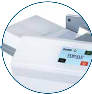
Drop-In Feeding System Dependable feeding of forms with no paper fanning required