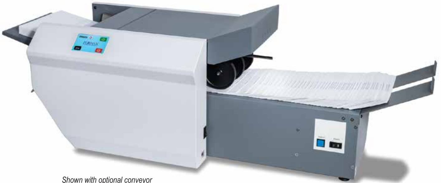
Shown with optional conveyor