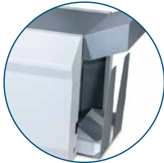
Adjustable Catch Tray Accommodates any fold type, stacks forms neatly and sequentially