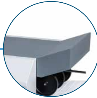
Insulated Fold Plates Top, side covers, and fold plates are insulated to reduce noise