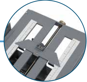
Easy to Adjust Fold Plates Clearly marked and easy to adjust for popular and custom folds