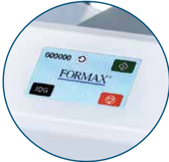
Color Touchscreen Control Panel Graphics-based and designed for easy, walk-up use

The FD 2006 AutoSeal® offers speeds of up to 8,000 forms per hour and the ability to process forms up to 14" long. Standard features include a color touchscreen control panel , insulated fold plates to reduce noise , and a drop-in top feed system , all in a compact and sleek desktop design. Fold plates are pre-marked for standard folds for 11" and 14" form sizes, and can be easily adjusted for custom folds. Fold types include Z, C, Uneven Z and C, Half and custom folds. Pressure seal mailers can be used for virtually any application that can be printed on one form, including checks, invoices, school reports, tax forms and appointment notices. Proudly made in the USA , the FD 2006 is built with proven Formax technology, and the durability to last.