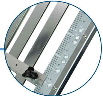
Clearly Marked Fold Plates Fold plates are pre-marked with four common fold settings