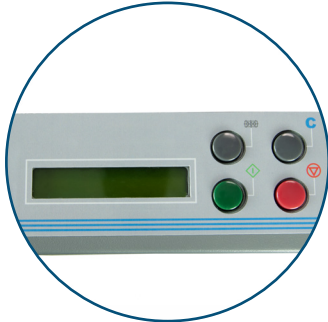
LCD Control Panel Features a 3-digit resettable counter with AutoBatch

The FD 314 Office Desktop Folder provides clearly-marked fold settings and push-button operation make it easy to use, right out of the box. It's capable of folding 11" and 14" paper at speeds up to 7,700 sheets per hour , with a hopper capacity of up to 250 sheets . Fold plates are pre-marked with four common fold settings letter, zig-zag, half and double parallel and can be easily adjusted for custom folds. The LCD control panel includes a resettable 3-digit counter , and AutoBatch for processing a set number of sheets with a pause between sets. The built-in output conveyor features easily adjustable stacker wheels for neat, sequential stacking of folded pieces.