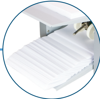
Output Conveyor & Stacker Wheels Stacker wheels can be adjusted for neat and sequential stacking