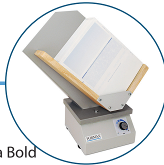
Optional Jogger Aligns paper and reduces static electricity commonly caused by printers