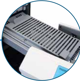
Fully Enclosed Paper Path Provides document security from printer to pressure sealer