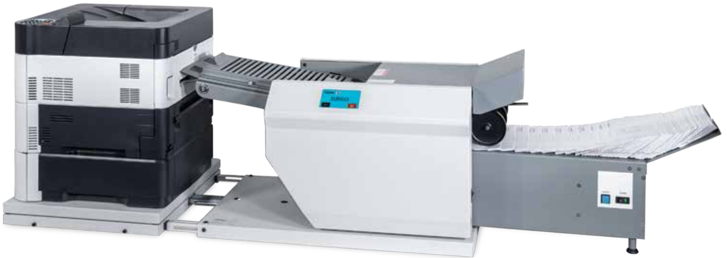
FD 2006IL System shown with IL Pressure Sealer and Alignment Base, laser printer (not included), and optional 18" conveyor