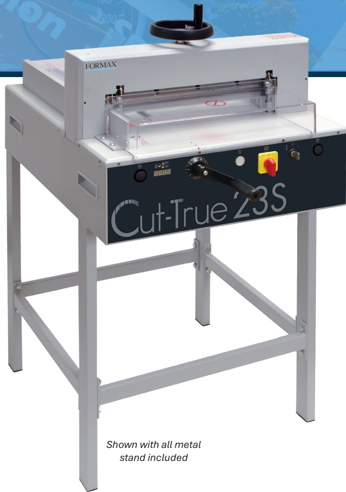
Shown with all metal stand included