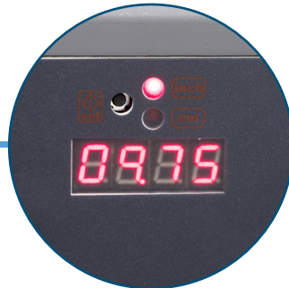
LED Back Gauge Display Get a precise cut using standard or metric settings