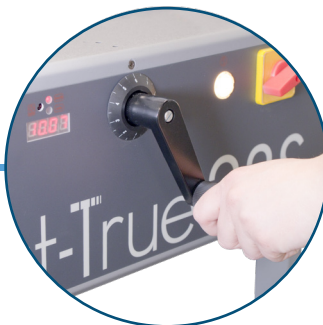
Manual Back Gauge Adjustment Fine-tune control for precision cutting