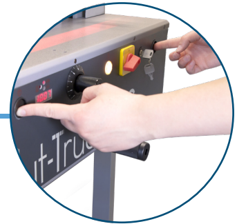
Two-Hand Operation Safely engages clamp and blade, keeping hands away from the cutting area