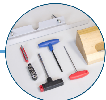
Blade Change Safety Tool Kit Change blades safely and easily, and make adjustments